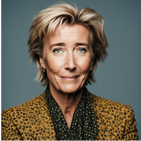
Actor/Activist Emma Thompson - Prominent advocate for environmental causes, particularly wildlife conservation.