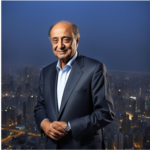
Entrepreneur Ahmed Al-Fayed - Billionaire investor with a keen interest in African development projects.