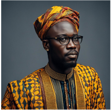
Musician Danfo Sonita – International music star with a passion for African culture and music.