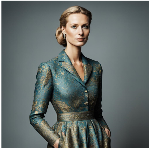
Princess Isabella von Hohenberg - European royalty known for her philanthropic work in Africa.